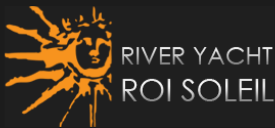
Canal du Midi route : Béziers – Carcassonne