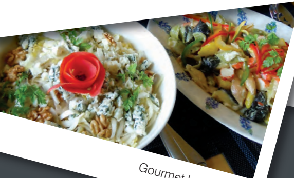
Gourmet buffet lunch